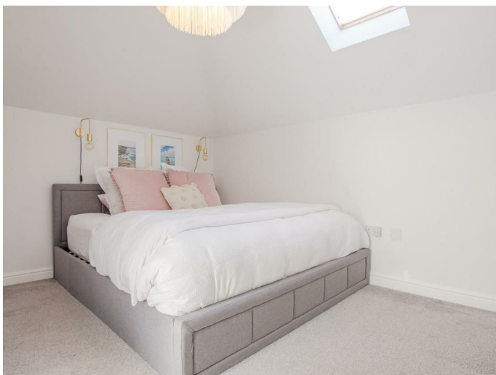
THIRD FLOOR 698 sq.ft. (64.9 sq.m.) approx.